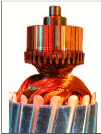
Typical armature and winding assembly (with commutator).

changes with temperature and these changes would affect the accuracy of the tests.